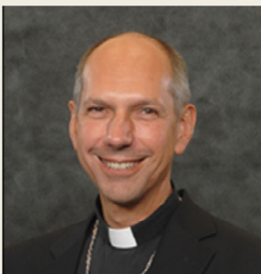
Truth and Reconciliation