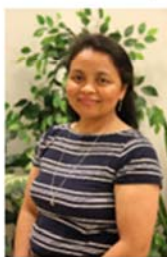
Rite of Welcome

Show them your support by responding on the RCIA Bulletin Board in the space for Parish Support.