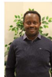
Rite of Welcome

I do have a background as a Christian; an Anglican to be specific when growing up. I have made the decision to join the RCIA and become a full Roman Catholic Christian because of my desire to be closer to God, and to fulfil my childhood goal to be Catholic. When growing up, most of my friends were Catholic, though Anglican at the time, I had the wish to become Catholic eventually. I also seek knowledge and deep understanding of the catholic faith.