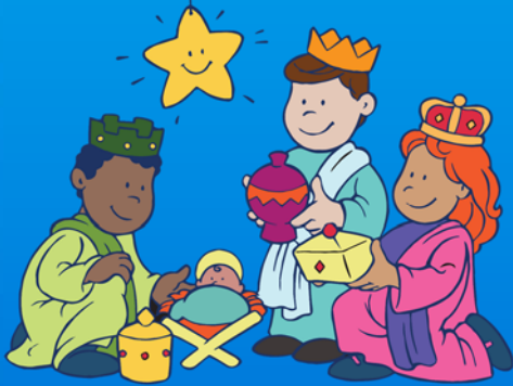
NATIVITY PAGEANT PRACTICE

Is your child not quite 4? A selection of children's books is available in the hallway. Please feel free to borrow these books during Mass.