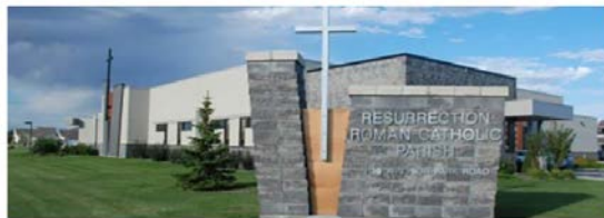
Livestreamed Masses from Resurrection Parish

Masses will be livestreamed from Resurrection Parish, Regina at 9:00 AM daily - archregina.sk.ca/live