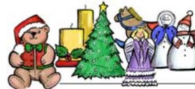
WINTER CRAFT & TRADE SHOW

Mondays starting at 10:00 am. Please see their FaceBook page - Resurrection Parish Moms Group for more information. Please use the South Office Entrance on Buckingham Drive and Ring the Doorbell.