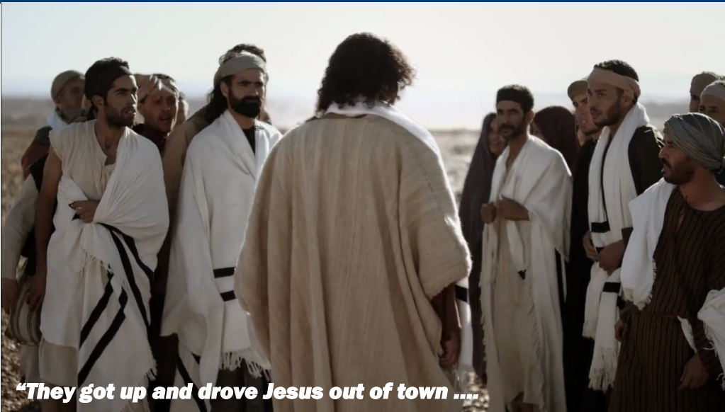
"They got up and drove Jesus out of town ..."