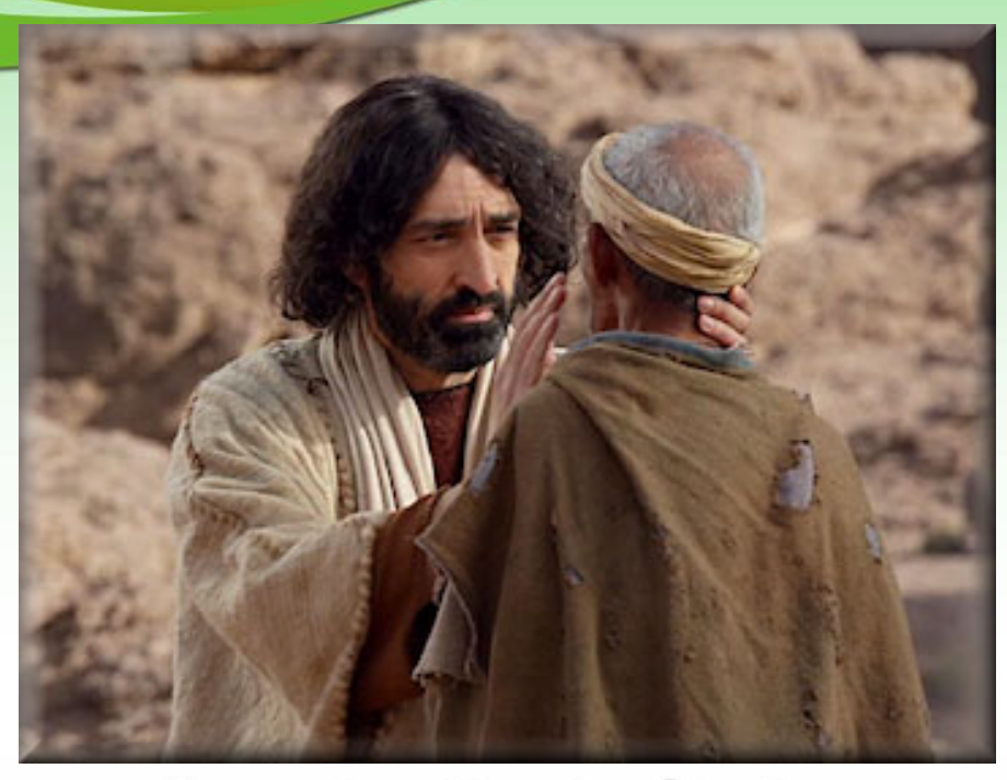
He makes the deaf to hear And the dumb to speak